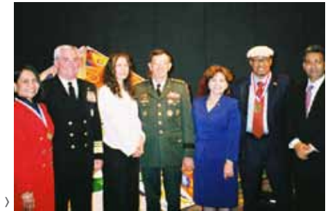
World Children Festival Awards Ceremony, Washington DC, 2003 ▶

In response to the tragedy of 9/11, he worked with leading psychologists and psychiatrists to develop a Peace through Art approach that was successfully field-tested in a program for Greek- and Turkish-Cypriot youth, partially funded by the Cyprus Fulbright Commission. In January 2005, he led a team of art therapists to develop a healing arts program that utilized the knowledge and experience gained from the treatment of child survivors of 9/11 to aid child victims of the Asian tsunami. Later that year ICAF volunteers were using their tsunami program experience to help Hurricane Katrina victims.