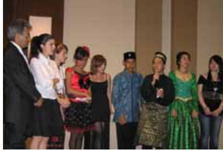
with the ICAF Youth Board Members, Washintgon DC, 2007