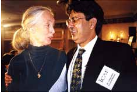
◀ With Jane Goodall, New York City, 2000