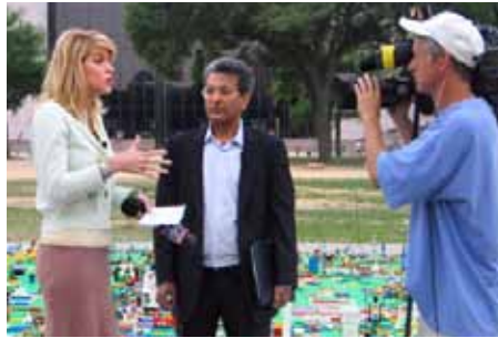
Fox News interview, World Children's Festival, 2007