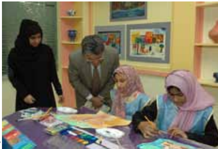
UAE school visit, Sharjah, 2003 ▶