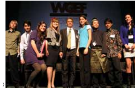
ICAF child panelists at the World Cultural Economic Forum in New Orleans, 2008

ment; the Wall Street's Institutional Investor; the National Association of State Boards of Education's State Education Standard; the oldest U.S. art teacher magazine SchoolArts; the Arab world's leading fine art publication Canvas; the International Public Relations Association's on-line Frontline bi-monthly; the Journal of Conflict Resolution; and the U.K.'s leading medical journal The Lancet.