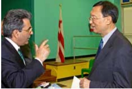
Chinese Ambassador Yang Jiechi, now Foreign Minister, Washington DC, 2005