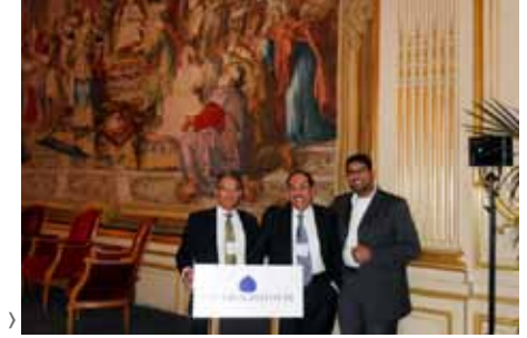
Aspen Insititute's Cultural Diplomacy Forum, Paris, 2008